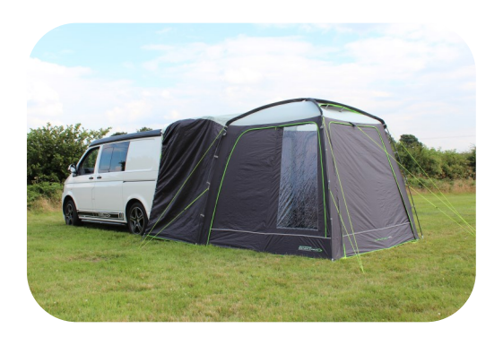
Cayman Tail Height: 220CM Adjust Height: 180-240CM 240CM 140CM

We highly recommend that you insure your driveaway against storm damage or accidental damage, as the warranty does not cover such eventualities. The manufacturer <u>IS NOT</u> liable for any damage caused to the awning or its contents due to misuse, incorrect pitching or extreme weather (full warranty details on rear of booklet).